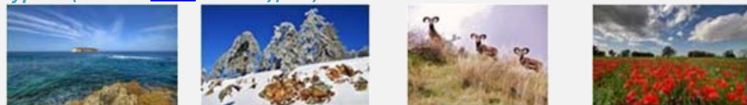
Cyprus Over the Seasons